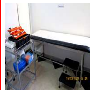
Children's treatment bed