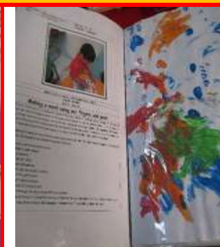
Creative notice board Snowdrop classroom Jolly Phonics letter "L"