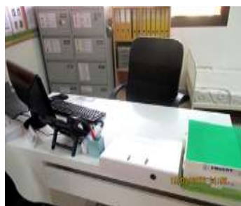
Welcome to your clinic

I am also responsible for Health and safety issues along with observing and supporting the housekeeping and kitchen staff in their daily schedules. The Nursery provides the children with an excellent 2 weekly rotating halal menu of healthy snacks, lunch and afternoon tea along with drinks. Our 4 housekeepers work and rotate in the 4 wings following a schedule of jobs aimed to keep all areas clean. The House of Colours has many clear Policies and Procedures in place which protect the Nursery staff, children and parents.