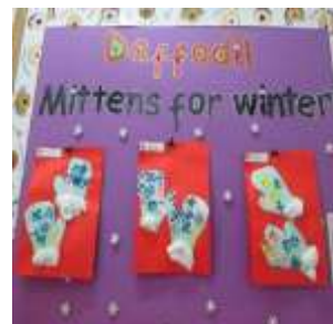
Creative notice board Daffodil classroom Seasons - winter