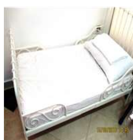
Children's resting bed