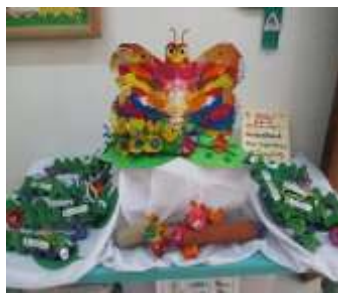
Creative interest table Bluebell classroom Life cycle of the Butterfly