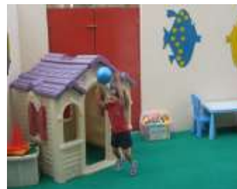
Early Learning Goal 12 Physical development Moving and handling