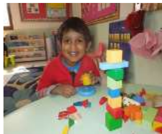
Early Learning Goal 4 Mathematics Shapes, space & measure