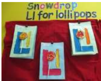
Creative notice board Snowdrop classroom Jolly Phonics letter "L"

All children have their own personal Learning Journal - this is a record of their journey through the Nursery. The staff take photographs each week, add a description and place them along with samples of their art work in the LJ's. Parents are invited to see the LJ's each term at the planned parent staff meetings and are given the LJ's to take home with them when the child finally leaves the Nursery.