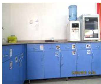
Medical storage cupboards