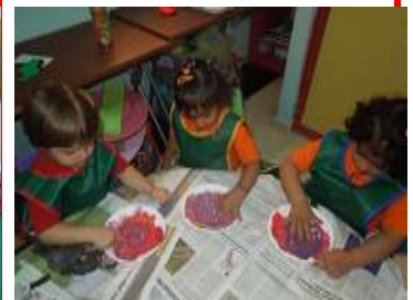
Early Learning Goal 16 Expressive arts design Exploring & using materials