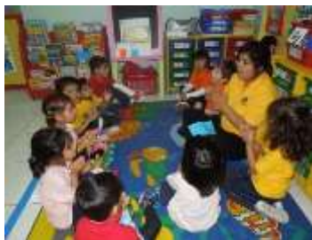
Early Learning Goal 3 Communication & language Speaking

I ensure that parents receive regular information letters to participate in their child's planned topics and events, and that every child receives a positive learning experience to develop to the fullest of his or her potential. I observe children who staff may feel seem to be experiencing any developmental concerns and feedback to parents and all of the above is done with daily discussions and the support of the teaching team.