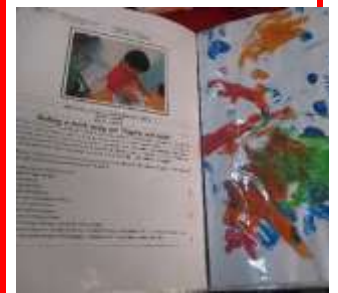
Learning Journal Weekly photos & art samples for each child