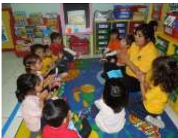
Early Learning Goal 3 Communication & language Speaking

I ensure that parents receive regular information letters to participate in their child's planned topics and events, and that every child receives a positive learning experience to develop to the fullest of his or her potential. I observe children who staff may feel seem to be experiencing any developmental concerns and feedback to parents and all of the above is done with daily discussions and the support of the teaching team.