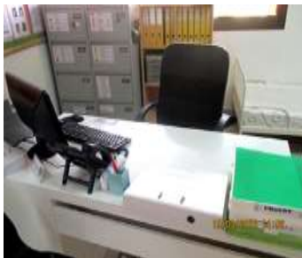
Welcome to your clinic

I am also responsible for Health and safety issues along with observing and supporting the housekeeping and kitchen staff in their daily schedules. The Nursery provides the children with an excellent 2 weekly rotating halal menu of healthy snacks, lunch and afternoon tea along with drinks. Our 4 housekeepers work and rotate in the 4 wings following a schedule of jobs aimed to keep all areas clean. The House of Colours has many clear Policies and Procedures in place which protect the Nursery staff, children and parents.