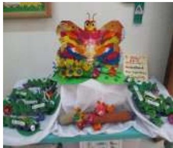
Creative interest table Bluebell classroom Life cycle of the Butterfly