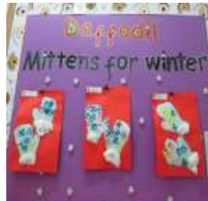
Creative notice board Daffodil classroom Seasons - winter