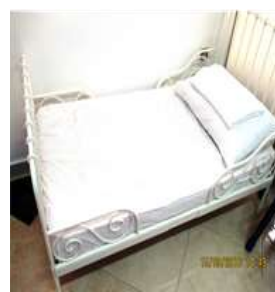
Children's resting bed