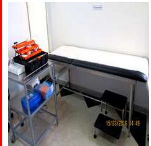
Children's treatment bed