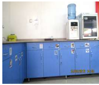
Medical storage cupboards