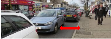
⊘ Parking away from the pavement

The road outside the Nursery is quite narrow and parking far from the pavement or at an angle means you are obstructing the flow of traffic, especially when there are cars parked on the opposite side of the road increasing the chance for accidents if your car was hit whilst you and your child were getting out the car.