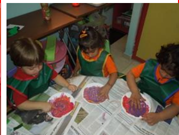
Early Learning Goal 16 Expressive arts design Exploring & using materials