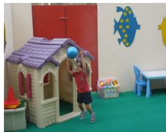
Early Learning Goal 12 Physical development Moving and handling