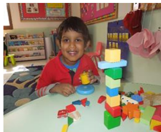
Early Learning Goal 4 Mathematics Shapes, space & measure