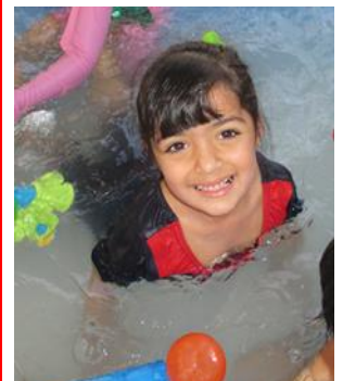
Ruwayah Al Kuwaiti Buttercup classroom I am a fish!