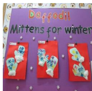
Creative notice board Daffodil classroom Seasons - winter