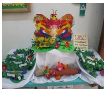
Creative interest table Bluebell classroom Life cycle of the Butterfly