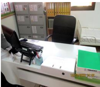
Welcome to your clinic

I am also responsible for Health and safety issues along with observing and supporting the housekeeping and kitchen staff in their daily schedules. The Nursery provides the children with an excellent 2 weekly rotating halal menu of healthy snacks, lunch and afternoon tea along with drinks. Our 4 housekeepers work and rotate in the 4 wings following a schedule of jobs aimed to keep all areas clean. The House of Colours has many clear Policies and Procedures in place which protect the Nursery staff, children and parents.