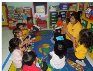
Early Learning Goal 3 Communication & language Speaking

I ensure that parents receive regular information letters, and that every child receives a positive learning experience to develop to the fullest of his or her potential. I observe children who staff may feel seem to be experiencing any developmental concerns and feedback to parents and all of the above is done with daily discussions and the support of the Nursery Director and the teaching team.