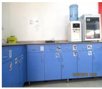
Medical storage cupboards