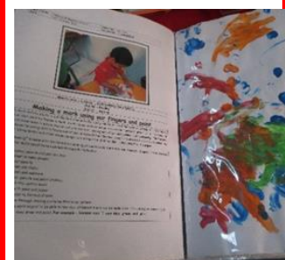
Learning Journal Weekly photos & art samples for each child