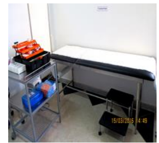
Children's treatment bed