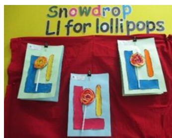
Creative notice board Snowdrop classroom Jolly Phonics letter "L"

All children have their own personal Learning Journal - this is a record of their journey through the Nursery. The staff take photographs each week, add a description and place them along with samples of their art work in the LJ's. Parents are invited to see the LJ's each term at the planned parent staff meetings and are given the LJ's to take home with them when the child finally leaves the Nursery.