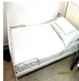
Children's resting bed