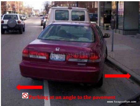
⊘ Parking at an angle to the pavement

Parking next to the pavement, is the safest way to park and gives maximum space to other road users.