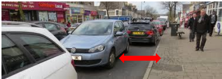
⊘ Parking away from the pavement

The road outside the Nursery is quite narrow and parking far from the pavement or at an angle means you are obstructing the flow of traffic, especially when there are cars parked on the opposite side of the road increasing the chance for accidents if your car was hit whilst you and your child were getting out the car.